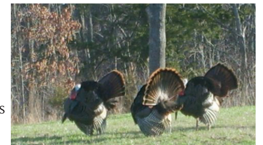
Above: Dwan's favorite spot Below: Wild turkeys on the property

Gerald's family has homesteaded the property since 1958. With rugged bluffs, oak-hickory forests, streams, and shoreline, the property is home to an abundance of wildlife including black bear, deer and wild turkey. Other conservation benefits include protecting water quality and scenic views.