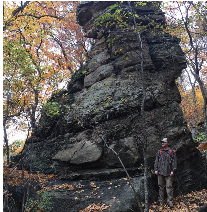
10 acre forested parcel on the west side of Kessler Mountain

An additional 90 acres of forested habitat in the Greater Kessler Mountain Wildlife Region were permanently conserved in 2018, bringing the total acreage of protected land to nearly 700. This priority landscape was identified by the land trust for its importance in protecting plant and animal species, water quality, climate resiliency, recreation and scenic values. Connected natural landscapes are critical for wildlife movement and survival.